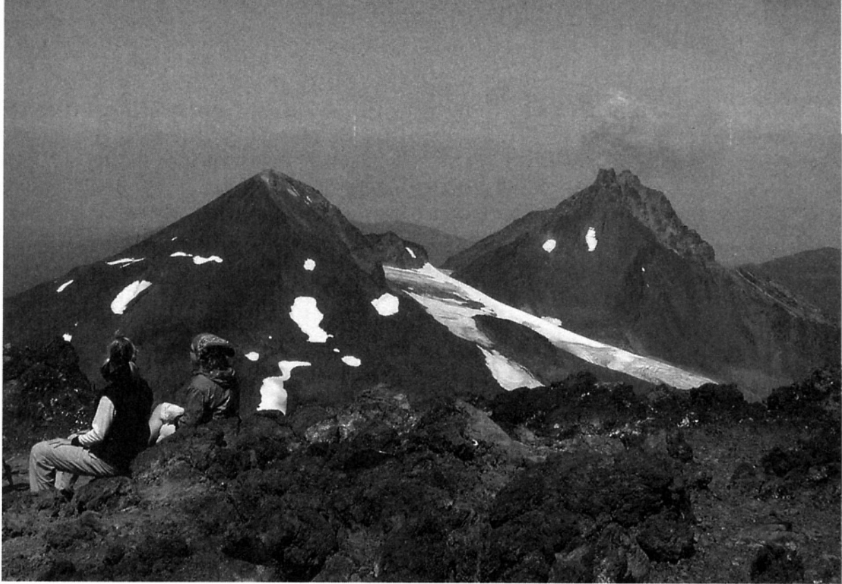
From the summit rim of South Sister, scramblers have a wonderful view of Middle and North Sister

Descend the way you came, scrambling down carefully on the loose cinders and scree. Please use care and stay on the path—the whole upper mountain is heavily eroded from overuse.