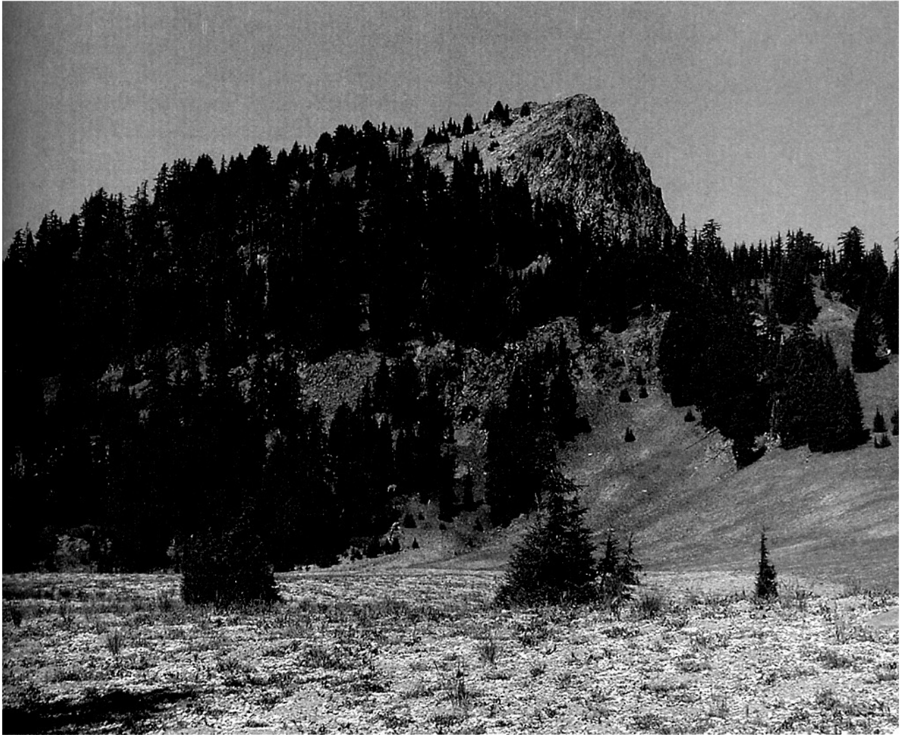
The Wife from across the Wickiup Plain

Conte Crater on the right. Evidence of volcanism is all around on this scramble approach.